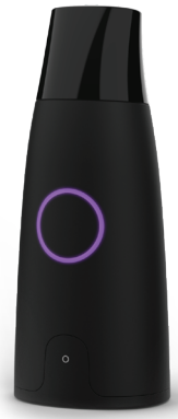
Lumen® V2 P/N MF-V2 Instructions for Use

For technical assistance or customer support, contact: Lumen Customer Services: support@lumen.me