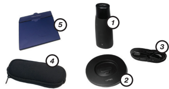
Fig 2. Lumen MF-V2 Kit Contents

The Lumen MF-V2 Kit includes the items illustrated in Figure 2