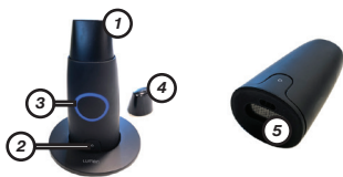
Fig 3. Lumen Device

The acquired data is analyzed by a proprietary Lumen algorithm to determine the source of the user's body fuel (carbs or fats). This information is transmitted via Bluetooth® to the Lumen App - where the patent-pending Lumen technology provides personalized nutrition recommendations and daily guidance.